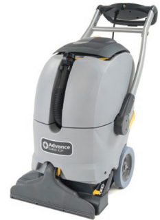
Wesclean Item: 6950083