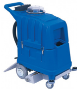
Wesclean Item: 5800135

Running under 60 dB, the AV12QX is excellent for any 24 hour facility, especially in the hospitality and healthcare industries. The spring-loaded vacuum shoe is adjustable, ensuring consistent pressure and pick up on different carpet thicknesses and uneven floors.