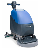
Wesclean Item: 1900072

The TTB1120 has an 11-gallon solution and recovery tank, making this 20in battery walk behind scrubber compact to scrub in tight places. The scrubber is lightweight and is easy to operate with adjustable handles for the operator.