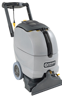
Wesclean Item: 6950081