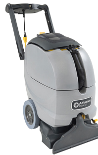
Wesclean Item: 6950082