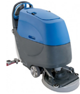
Wesclean Item: 1900086

The TTB 1620T is a large-capacity 20" traction drive scrubber built for durability and longevity. Adjustable solution flow rates ensure that the proper amount of water is used, while the control panel monitors critical operating levels.