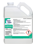
Wesclean Item: 0170117

An earth friendly cleaner that can meet the toughest indoor and outdoor environmental restrictions. With a low pH (2.2) it will neutralize alkaline residues and improve coating adhesion on alkaline surfaces. Ideal for use on VCT and hard floor surfaces. This product is excellent for use after stripping processes and during winter months to remove salt build up.