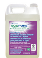
Wesclean Item: 7770065

Neutralizes alkaline residues and effectively removes salt and calcium deposits on most floor surfaces and industrial carpeting. This remarkable detergent not only neutralizes the residual effects of strippers and cleaners, but it also is a super efficient cleaner. Its deep penetrating action helps suspend the dirt and residue, lifting it to the surface for easy neutralization and removal.