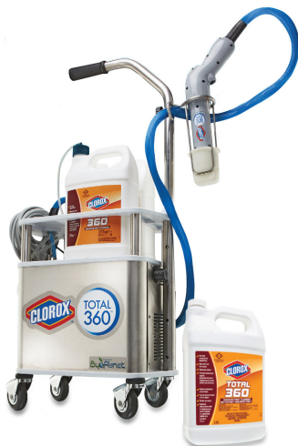
Wesclean Item: 8880000 / 44330004

Clorox® Total 360® Disinfectant Cleaner® is registered with Health Canada to kill 18 illness-causing organisms in two minutes or less! The ready-to-use, one-step disinfectant eliminates odors and kills outbreak-causing viruses like influenza, rhinovirus and norovirus and MRSA and Vancomycin Resistant Enterococcus faecium (VRE). Its non-bleach-based formula is specifically designed for broad surface compatibility, making it ideal for use on a wide variety of surfaces.